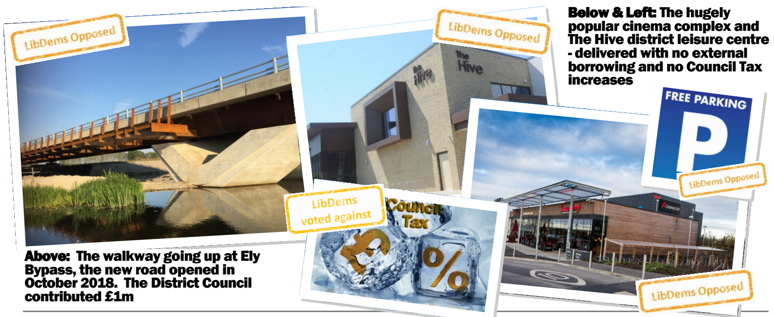
Above: The walkway going up at Ely Bypass, the new road opened in October 2018. The District Council contributed £1m