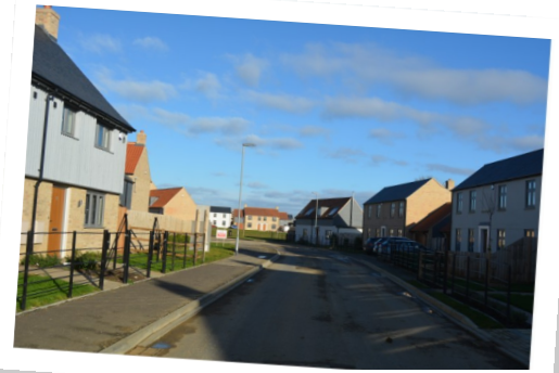
Above: Stretham Community Land Trust

CLTs decide where new housing should go, how much of it there should be,