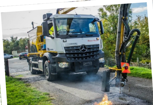
Above: The Dragon Patchers can fix more than 1,000 potholes every week

Conservatives: £13.1m extra into our highways THIS WINTER